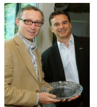
Donor Award winner— Whole Foods Market, White Plains