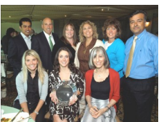
Corporate Service Award winner—PepsiCo Foundation and Pepsi Beverage Company