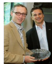
Donor Award winner— Whole Foods Market, White Plains,