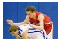
S. Cayuga v. Trumansburg Boys Basketball