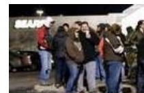
Black Friday in Ithaca