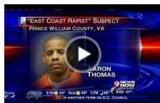
'East Coast Rapist' to Appear in Va. Court Nov 30, 2011