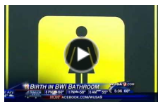
Woman Gives Birth In BWI Airport Bathroom Nov 29, 2011