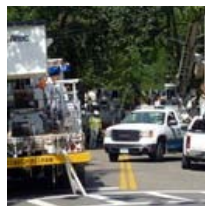
Crews Work to Restore Power Lines on Pelhamdale