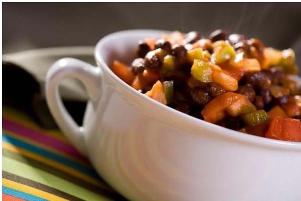
Pantry stocked with Irene-proof foods? Here's some ideas for what to do with all those canned goods.