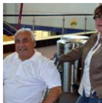
Travelers Stranded at Westchester Airport