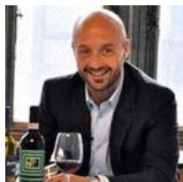
Tarry Lodge Reconsiders Chianti