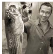
BarTaco: Stamford's Next Big Catch